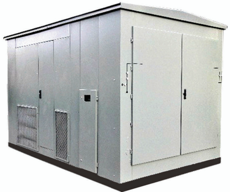
Package Substation up to 2 MVA, 36kV Class