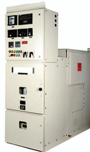
Indoor/Outdoor VCB Panel : 12/24/36kV Class