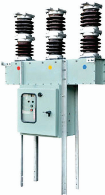
Porcelain Clad Vacuum Circuit Breaker : 12kV & 36kV Class