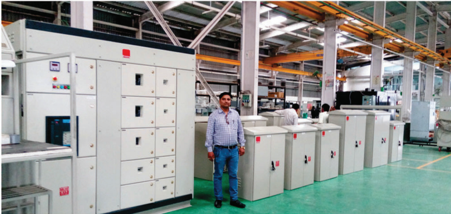
LT Panels/APFC Panels/Feeder Pillars