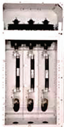
Indoor/Outdoor LBS/SFU RMU 12/24/36 kV Class